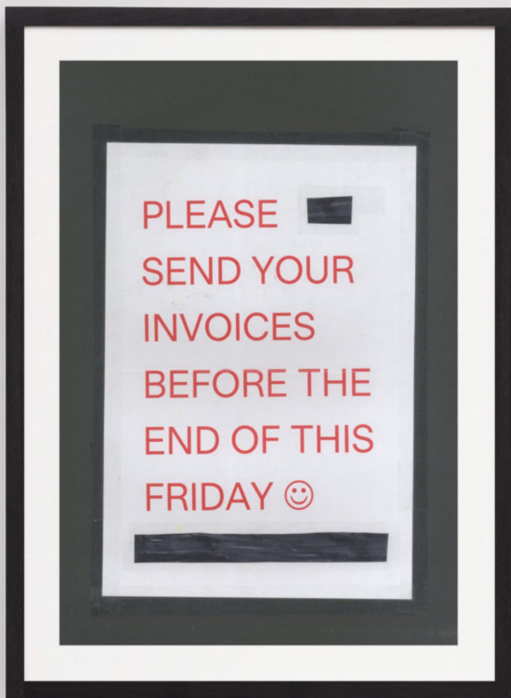
Nicholas Cheveldave, Untitled (2019).

Who: Cheveldave's collages deal with information taken