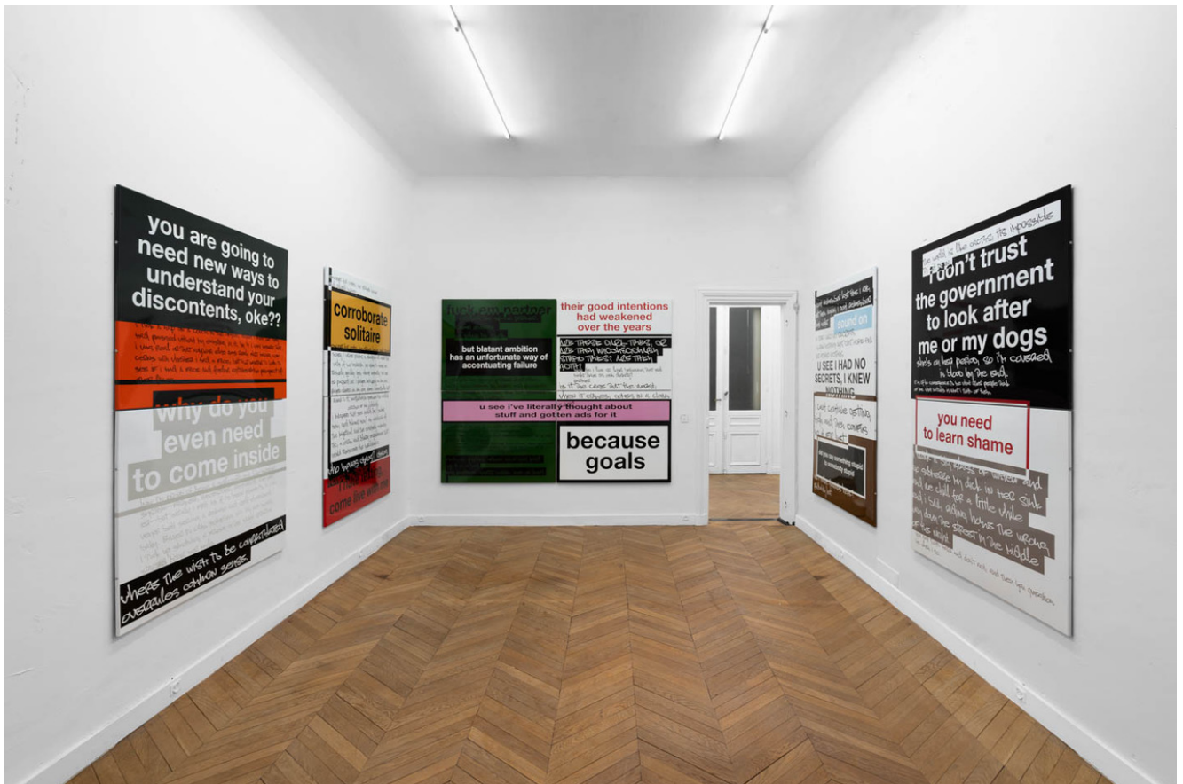
Installation view of Nora Turato at Gregor Staiger in Paris Internationale.

Who: Turato is a Croatian artist with a background in graphic design, music, and performance. Born in 1991 in Zagreb, the 28-year-old appropriates texts from the