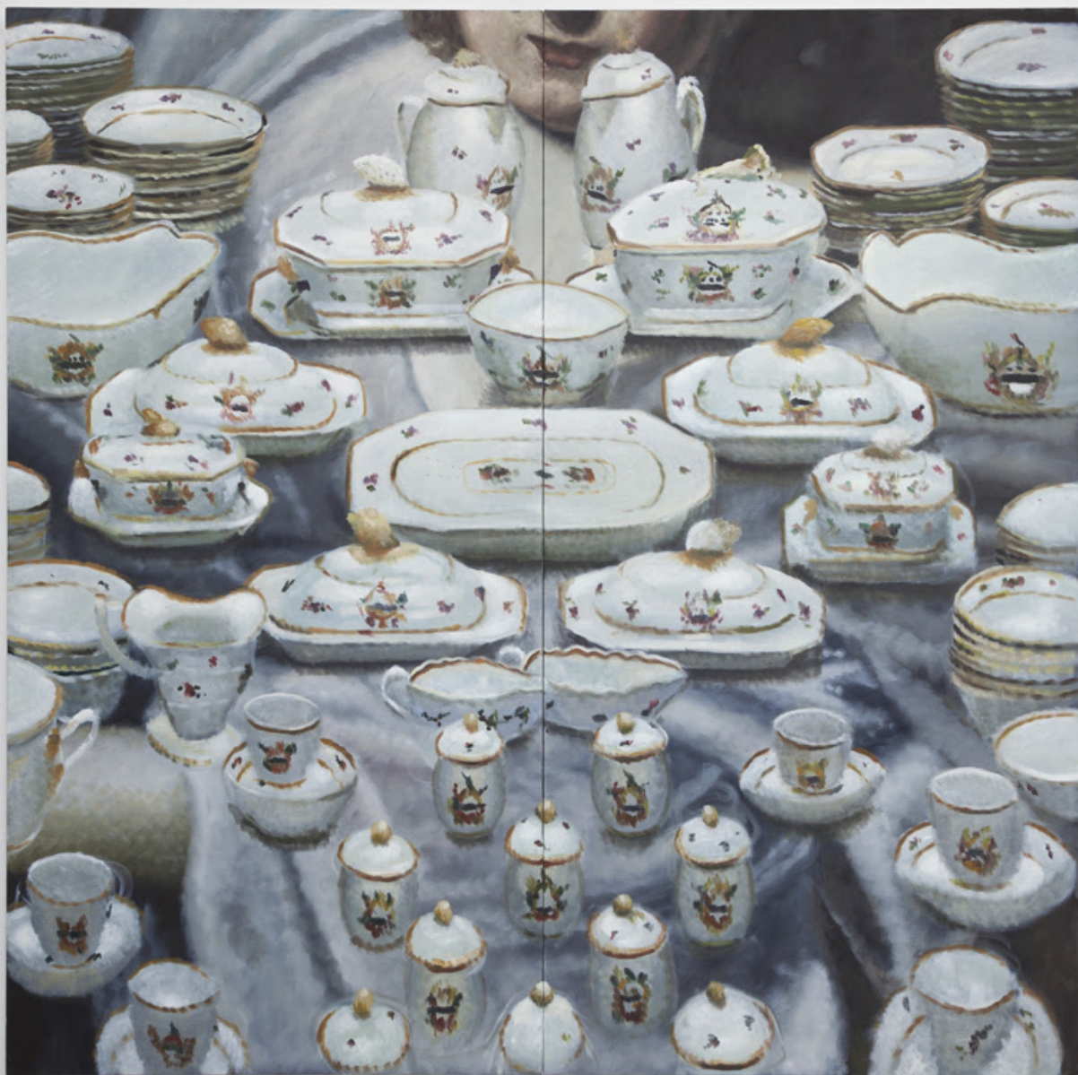
Issy Wood, Excuse me / your life is waiting (2019).